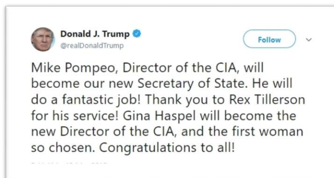
Figure 2. Tillerson's dismissal was announced through twitter, which was unconventional

Finally, these differences made Trump to dismiss Tillerson immediately after the latter's trip to Africa on March, 13 and replace Mike Pompeo in his twitter page, which was an unconventional diplomatic behavior. Contrary to Tillerson, Pompeo is regarded as strong supporter of Trump's viewpoints, who reflects the latter's personal views in foreign policy (Pillar, 2018).