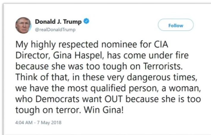
Figure 3. Trump strongly defended Haspel, despite increasing criticisms